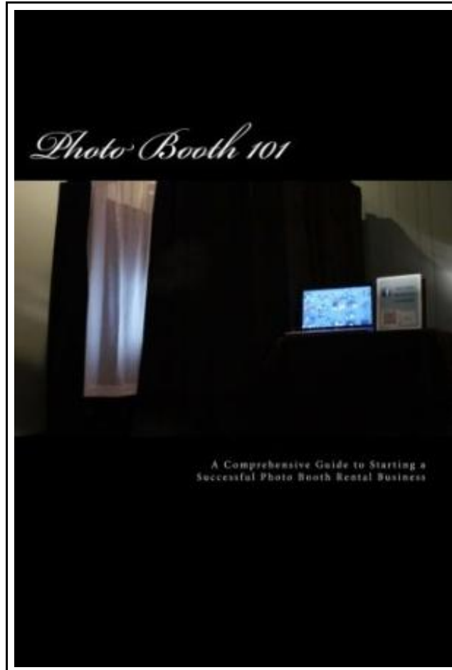
Photo Booth 101: A Comprehensive Guide to Starting a Successful Photo Booth Rental Business (Paperback)